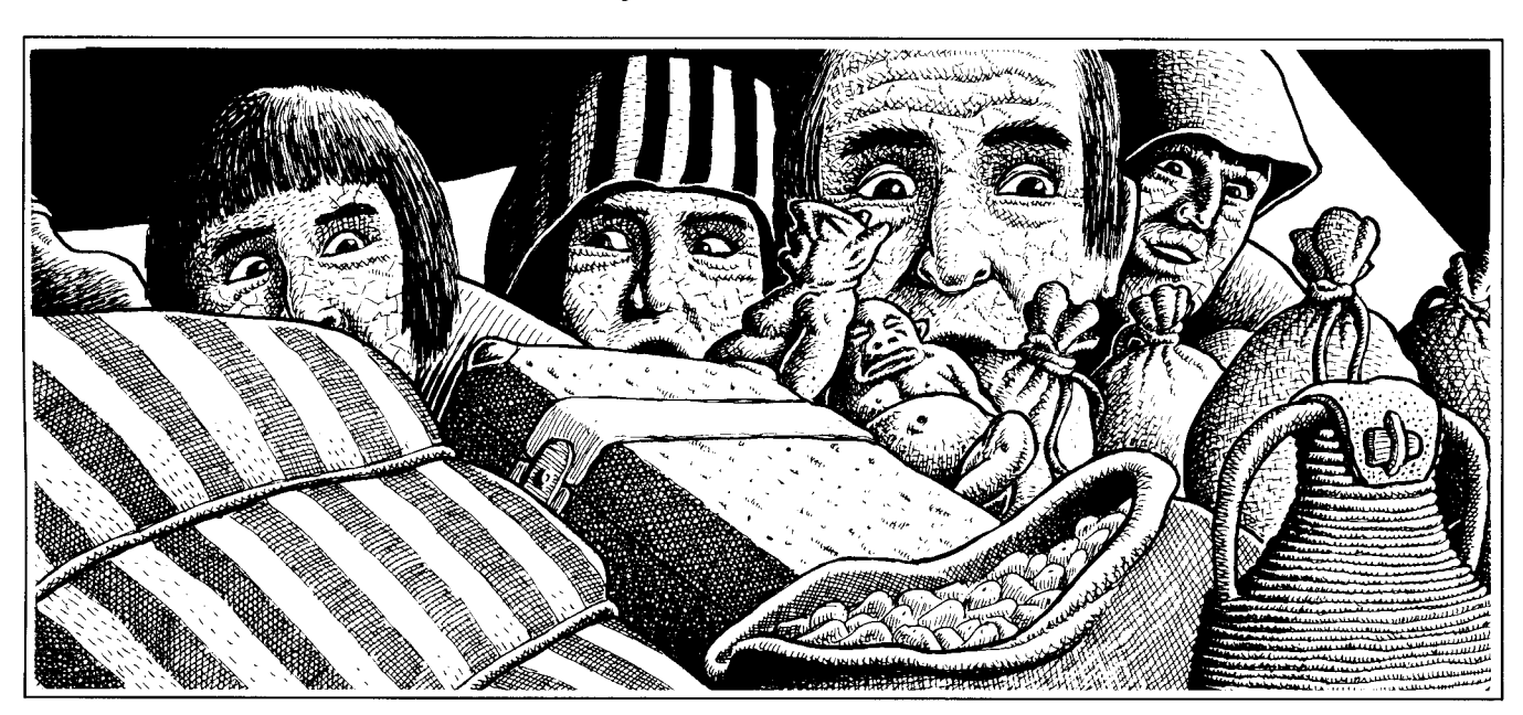
The lepers were excited to find food and many valuables left by the Syrian soldiers.

1. God miraculously fed 100 men with _________ loaves of barley ________ and a few ears of ________. 2. What person did Elisha restore to life? ________. 3. What did Naaman have to do to be healed by God of leprosy? _______. 4. Why did Gehazi become a leper? _______. 5. Elisha tossed a small ________. into the water causing the _______ to float. 6. Why did the Syrians suddenly flee from their camp? _______.